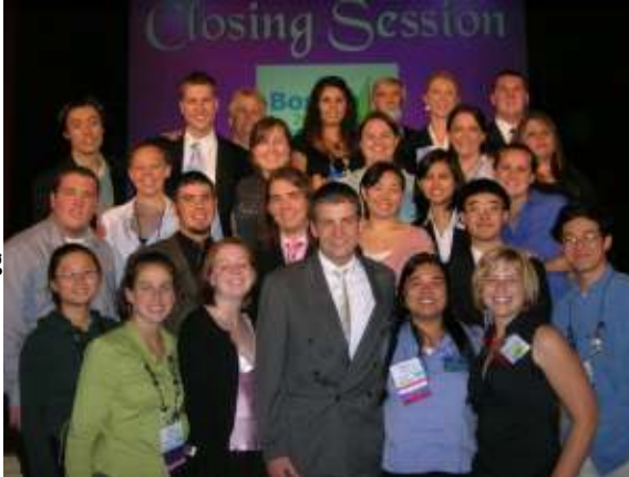
Group picture of PNW ICON attendees after closing session

I attended the Leadershape Institute in Bradford Woods in Indiana during May. I was able to share information and learn from other Circle Ker's in other districts. We helped strengthened and critique each other's vision. During my stay in Asia this summer I managed to do some humanitarian work in the countryside of Cambodia. I've also enjoyed representing us during International Convention in Boston, MA this past week. I hope that all of you make an effort to attend ICON next year because it will be held in the PNW district in Portland, OR!