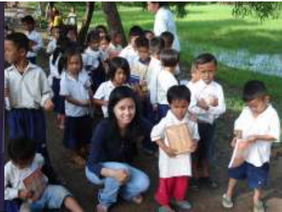
Passing out donated school supplies and money to elementary school students in the countryside of Cambodia