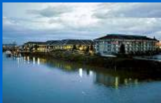
Jantzen Beach Red Lion Hotel