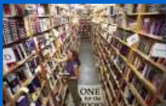
Powell's City of Books